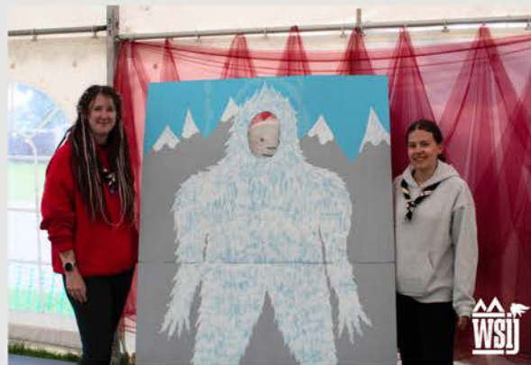
Mountain Legends Sub Camp Team

Being sub camp leader at WSIJ 2025 has been a thoroughly exciting experience. From helping out units by answering questions and solving problems to delivering the Hermes Herald there hasn't been a dull moment. Seeing all of the young people complete the Crock o' gold challenges and reading all of their favourite moments on the story pages has been very rewarding and our favourite part of the camp so far. Mountain Legends Sub Camp Leaders