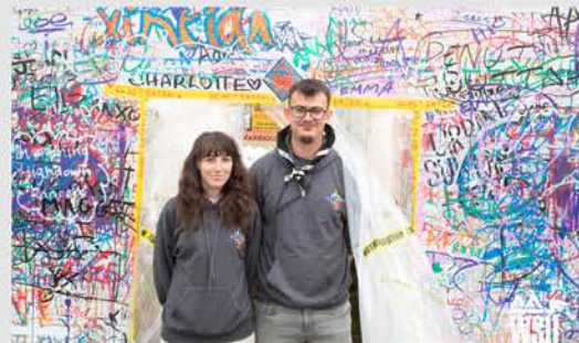
Urban Legends Sub Camp Team