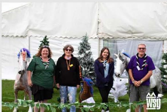
Forest Legends Sub Camp Team