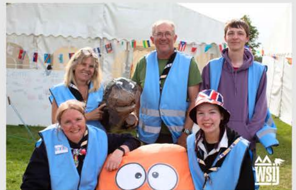
Sea Legends Sub Camp Team